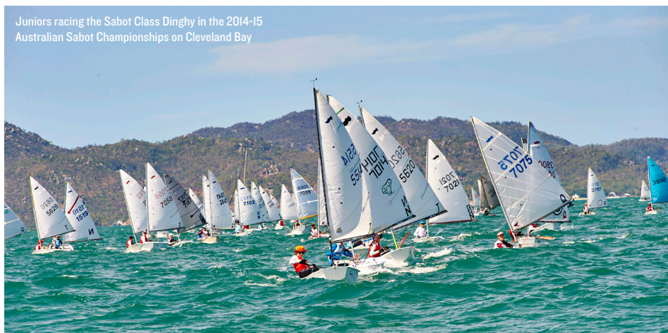
Juniors racing the Sabot Class Dinghy in the 2014-15 Australian Sabot Championships on Cleveland Bay