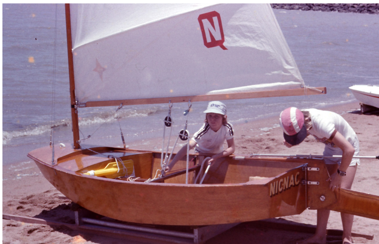
Figure 1 First Sabot NICNAC 1979 Cleveland Bay