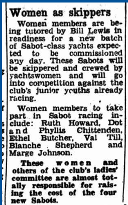
Figure 6 Daily Mercury 1954