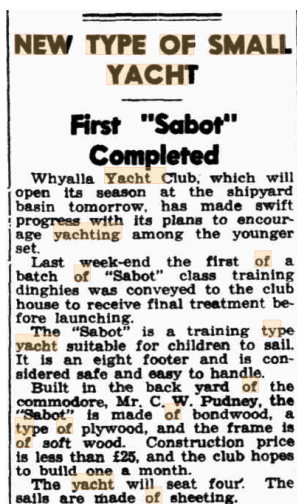
Figure 8 Newspaper article Whyalla 1953