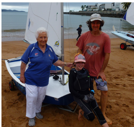
Figure 2 Grandma, Dad & Daughter all still sailing Cleveland Bay 2021

and improve their sailing techniques. It has been said that if you grow up learning to sail a Sabot, then you can sail anything!