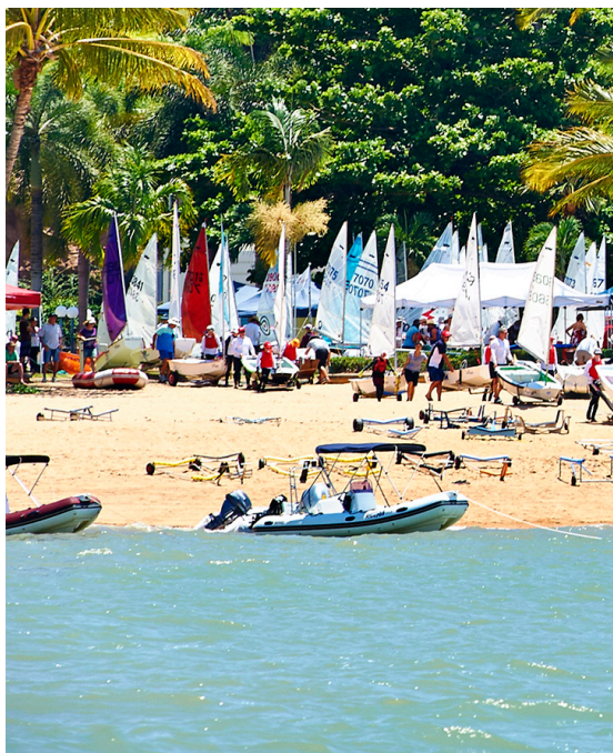
Juniors racing the Sabot Class Dinghy in the 2014-15 Australian Sabot Championships on Cleveland Bay

As the Commodore of the Townsville Sailing Club (TSC) I'd like to welcome you and your families to the capital of North Queensland to participate in the 57th National Sabot Championships from the 1st to the 8th of July 2021. We are looking forward to hosting your regatta and are well prepared to provide you with a first-class event, on the wonderful waters of Cleveland Bay.