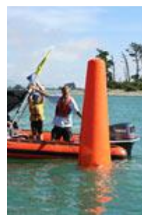
Marker Buoy fully inflated