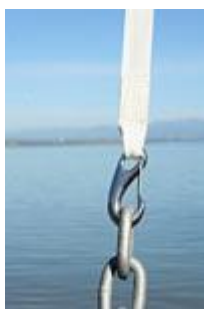
Marker Buoy Clip On Ballast