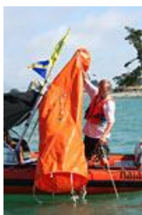
Deploying the Self Inflating Marker Buoy